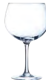
VINA 70 cl Ø M = 113 mm H = 195 mm W = 222 g N2760 F6/B2=12·P/P=216