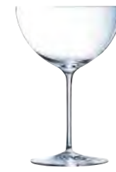
CHAMPAGNE & COCKTAIL 35 cl