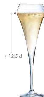
OPEN'UP 20 cl Ø M = 74 mm H = 234 mm W = 161 g U1051 F6/B4=24-P/P=480