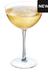
CHAMPAGNE & COCKTAIL 21 cl