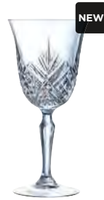
BROADWAY 25 cl Ø M = 89 mm H = 188 mm W = 290 g Q7932 F6/B4=24 - P/P=384