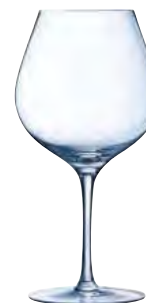
CABERNET ABONDANT 70 cl Ø M = 110 mm H = 220 mm W = 256 g FJ037 F6/B2=12-P/P=216