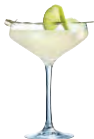
CHAMPAGNE & COCKTAIL 30 cl

Ø M = 114 mm H = 179 mm W = 168 g L3678 F6/B4=24 · P/P=192