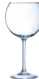
VINA 58 cl SPLENDID Ø M = 106 mm H = 209 mm W = 212 g P7908 F6/B4=24·P/P=240