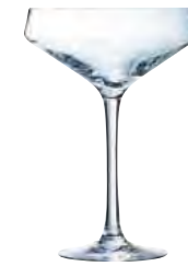
CHAMPAGNE & COCKTAIL 30 cl