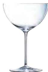
CHAMPAGNE & COCKTAIL 35 cl

Ø M = 120 mm H = 170 mm W = 173 g N6815 F6/B2=12 · P/P=240