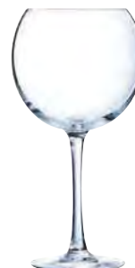
CABERNET BALLON 70 cl Ø M = 113 mm H = 221 mm W = 270 g 46981 F6/B4=24-P/P=192