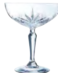
BROADWAY 25 cl Ø M = 115 mm H = 138 mm W = 270 g P8796 F6/B4=24 · P/P=324