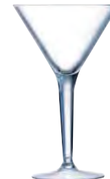
OUTDOOR PERFECT 30 cl Ø M = 118 mm H = 190 mm W = 89 g E9293 F6/B4=24 · P/P=192