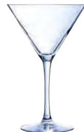
CHAMPAGNE & COCKTAIL 30 cl

Ø M = 120 mm H = 188 mm W = 220 g N6831 F6/B2=12-P/P=192 N4594 TA12 = 12-P/P=192