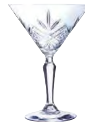
BROADWAY 21 cl

Ø M = 118 mm H = 153 mm W = 265 g P8795 F6/B2 = 12-P/P=216