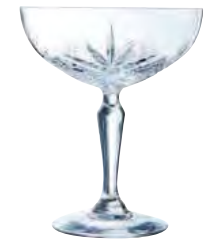
BROADWAY 25 cl