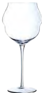
MACARON 60 cl Ø M = 105 mm H = 235 mm W = 195 g I9414 F6/B2=12-P/P=240