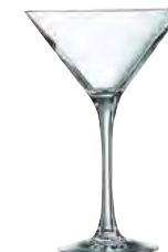
COCKTAIL 15 cl

Ø M = 95 mm H = 165 mm W = 139 g 50056 F6/B4=24-P/P=288