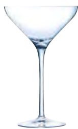
CHAMPAGNE & COCKTAIL 21 cl

Ø M = 114 mm H = 179 mm W = 168 g L3678 F6/B4=24 · P/P=192