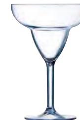
OUTDOOR PERFECT 30 cl Ø M = 122 mm H = 176 mm W = 97 g E9304 F6/B4=24 · P/P=192