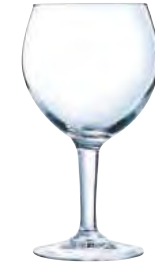
COCKTAIL 62 cl PARTY Ø M = 109 mm H = 195 mm W = 285 g P8064 F6/B2=12·P/P=216