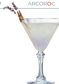
WEST LOOP 27 cl

Ø M = 113 mm H = 168 mm W = 230 g Q4027 F6/B2=12-P/P=240