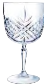
BROADWAY 58 cl Ø M = 107 mm H = 195 mm W = 460 g P8821 F6/B4=24·P/P=240