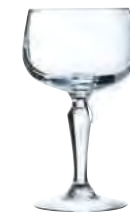
MONTI 27 cl