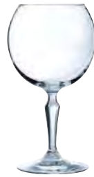
MONTI 58 cl Ø M = 106 mm H = 187 mm W = 241 g Q1257 F6/B2=12·P/P=216