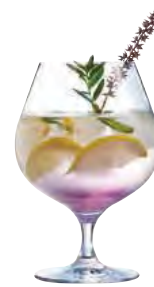
SPIRITS 70 cl Ø M = 113 mm H = 166 mm W = 199 g N8172 F6/B4=24·P/P=192