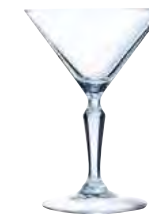
MONTI 21 cl

Ø M = 116 mm H = 156 mm W = 209 g Q1325 F6/B2=12-P/P=216