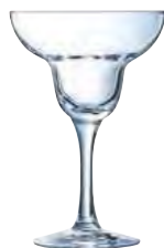
MARGARITA 27 cl

Ø M = 109 mm H = 160 mm W = 208 g 79923 F6/B4=24-P/P=192