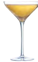
CHAMPAGNE & COCKTAIL 21 cl