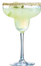
CHAMPAGNE & COCKTAIL 44 cl

Ø M = 121 mm H = 192 mm W = 257 g N6900 F6/B2=12-P/P=192