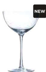
CHAMPAGNE & COCKTAIL 21 cl

Ø M = 110 mm H = 160 mm W = 148 g N8214 F6/B4=24 · P/P=192