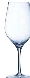
CABERNET SUPRÊME 62 cl Ø M = 95 mm H = 240 mm W = 253 g FJ035 F6/B2=12-P/P=288